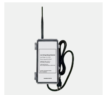
LumiNode 4 Bluetooth Controller