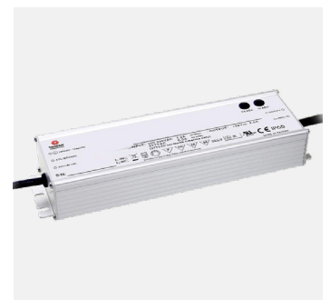
PowerCore 24-100 Driver